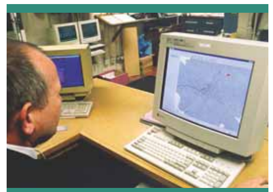
Star Track Central System

All the routes that have been improved with measures including star trak, have seen a significant increase in patronage. For example, the number 7 bus in Loughborough has seen such an increase in usage that the frequency has doubled from 20 to 10 minutes since the introduction of star trak.