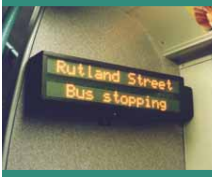
On bus display

Another element of the system is bus priority at signal-controlled junctions. If a bus is running late, it automatically transmits a variable 'lateness code' by radio to the signal controller as it approaches. The signal timings are then adjusted to favour the bus in a scale