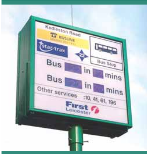
Public Transport Information in Leicester