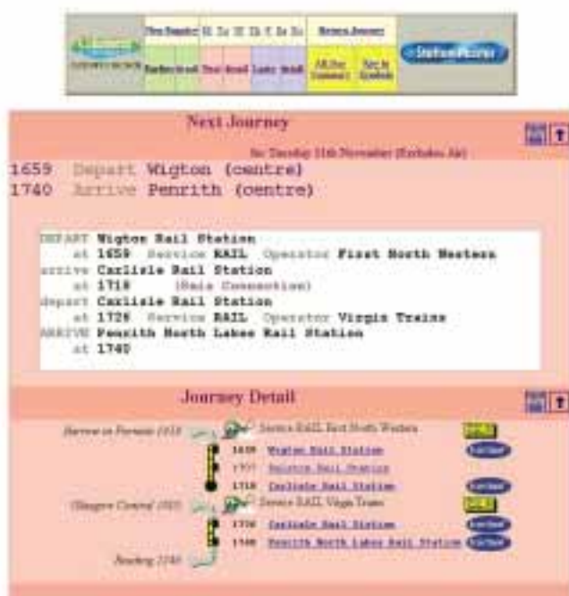
Typical Web based journey planner screen from Traveline

Where Public Transport Information systems are developed within a Urban Traffic Management and Control environment the UTMC common database can be used to store data, and a performance evaluation module can be developed to assist in monitoring, optimising and quantifying system performance. 'UTMC 05a Performance Criteria for UTMC Systems Handbook' and related Technical Note provide further advice on this; see the Related Documents section of this note.