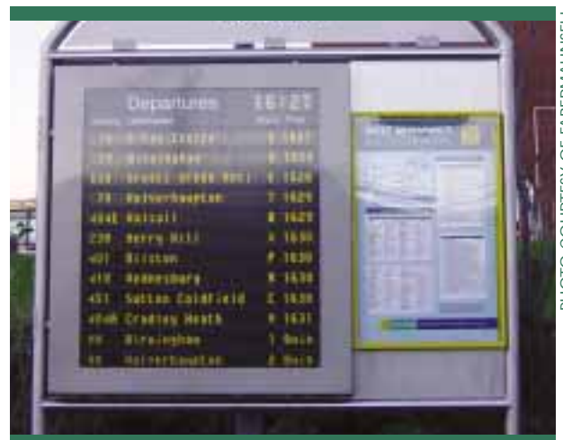
Information display at West Bromwich Bus Station