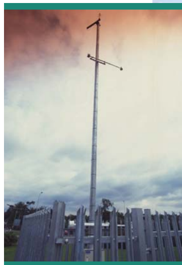
AIR QUALITY MONITORING EQUIPMENT

An important benefit of ITS is that it can be developed/modified relatively easily. ITS can be modified as situations or objectives change, which means that authorities can adapt a system to a new environment at a relatively low cost, when compared to modifying traditional infrastructure.