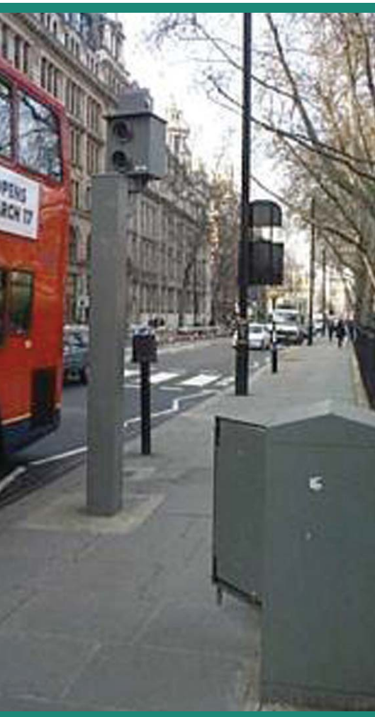
BUS LANE ENFORCEMENT CAMERA LONDON