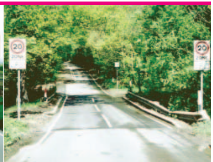
Northern entry to the scheme (left) had a greater speed reducing effect than the southern gateway