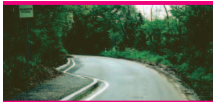
Verge erosion has continued opposite the passing places

The roadside verge along Bird Lane was considerably eroded before scheme implementation. Unfortunately, the nature of the scheme has led to continuing erosion opposite the passing places, probably because drivers move as far left as possible to wait for oncoming vehicles. Brentwood Borough Council has tried to overcome this problem by placing additional reflective posts at intervals along the lane. This has been only partially successful with vehicles continuing to encroach onto the verge between the posts. One possible alternative would be to use logs or kerbing alongside the carriageway as additional verge protection.