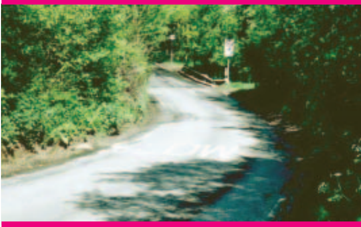
Lack of separate facility to the south of the scheme could put off vulnerable users

the narrower carriageway, they felt less safe travelling along Bird Lane than they had before scheme implementation. The fact that the non-motorised way is fairly narrow (about 1.5m) with a ditch alongside part of it may also have discouraged some cyclists and horse-riders from using this facility.