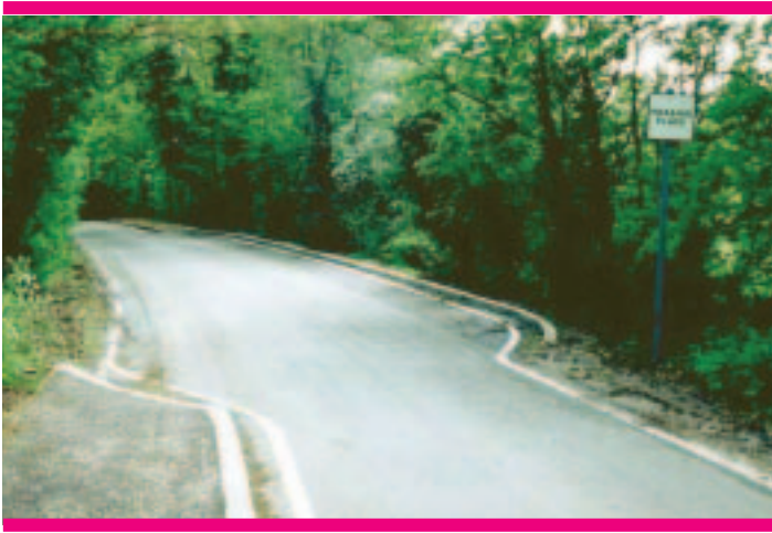
Some two-sided passing places were used to encourage giving way in both directions